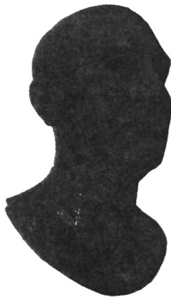
A bronze head of Sorex, a famous actor of Pompeii. Originally the eyes would have been inserted in lifelike colors.