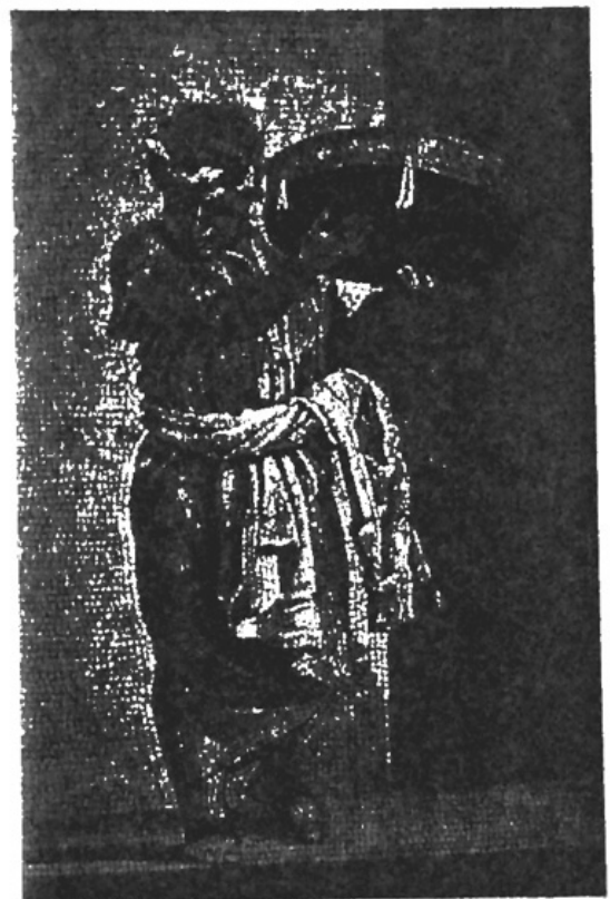
A mosaic of a theater musician.