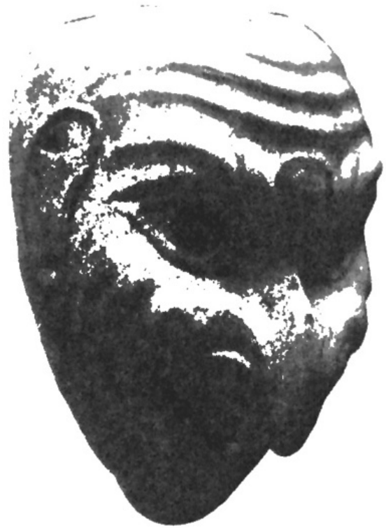
A clay model of a mask, perhaps for the character Manducus.

Sometimes, at a festival, the comedies of Plautus and Terence, playwrights of the second century B.C., were put on. These plays also used a number of familiar characters, but the plots were complicated and the dialogue more witty than that of the farces.